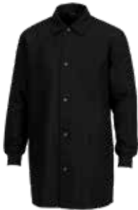
Fluid Resistant Warm Up w/ Collar DenLine® DL361