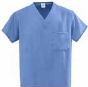
Unisex Scrub Top w/ Pockets Medline® 810NTH