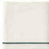
Knitted Fitted Sheet (36"x84"x12") SKU: 60