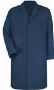
Lab Coat RedKap® KP14