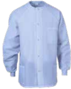
Fluid Resistant Warm Up/ No Collar DenLine® DL247