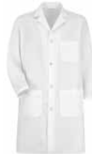
Unisex Lab Coat RedKap® 5700