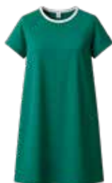
Teen Patient Gown SKU: 810