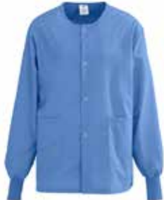
Unisex Warm Up Jacket Medline® 829NTH