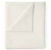
Pillow Case SKU: 40