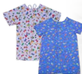
Pediatric Gown Medium SKU: 811 Large SKU: 812