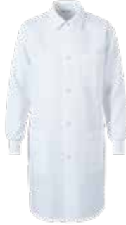
Fluid Resistant Lab Coat w/ Collar DenLine® DL470BJ