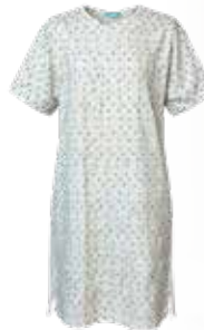
IV Gown SKU: 826