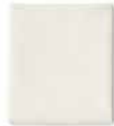
Dr. Flat Sheet (54"x90") SKU: 41