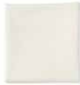
72" Flat Sheet (Twin) SKU: 43 81" Flat Sheet (Double) SKU: 44