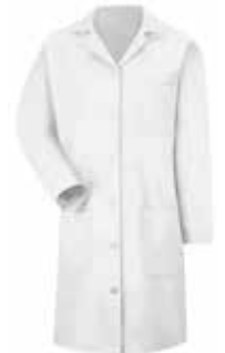
Women's Lab Coat RedKap® KP13