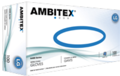
3 mil Nitrile Exam Gloves (Small-XL)