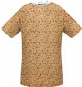
Yellow Patient Gown (3-10XL) SKU: 828