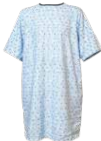
Blue Patient Gown (M-2XL) SKU: 821