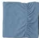
Blue Fitted Gurney Sheet SKU: 65

Delivering HLAC-accredited, hygienically clean linen and uniform solutions you can trust.