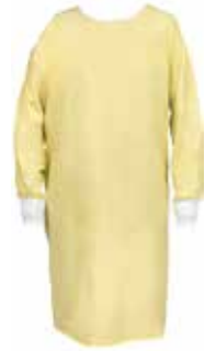
Isolation Gown DenLine® 813