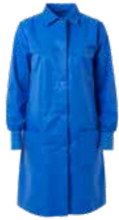
Fluid Resistant Lab Coat w/ Collar DenLine® DL151BJ