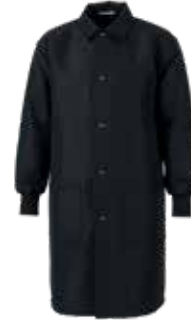
Fluid Resistant Lab Coat w/ Collar DenLine® DL360