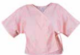
Mamo Cape SKU: 900