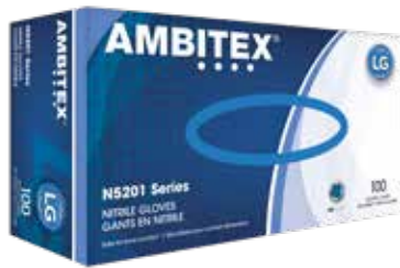
4 mil Blue Nitrile (XS-XXL)