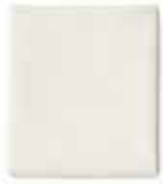
Dr. Flat Sheet (54"x90") SKU: 41