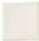
72" Flat Sheet (Twin) SKU: 43 81" Flat Sheet (Double) SKU: 44