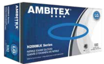
4.5 mil Black Nitrile Exam Gloves (Small-XL)